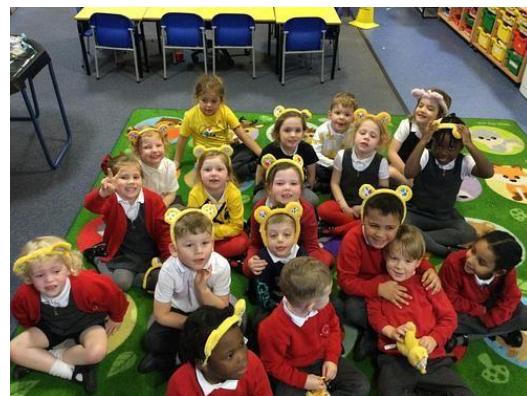
Enthusiastic Pudsey dressed pupils at Damson Wood Nursery and Infant School.